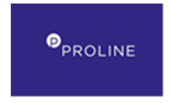
Proline – The Champion's Choice